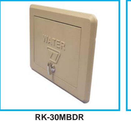
Thumb Latch Cylinder Lock