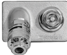
Model 85 Woodford Freezeless Anti-Contamination 34HW Vacuum Breaker (55180 Nozzle Required)