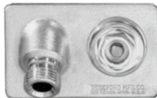
Model 80 Woodford Freezeless

All parts available except deep box castings - Parts same as Y70 Hydrant or Model 70 and 80.