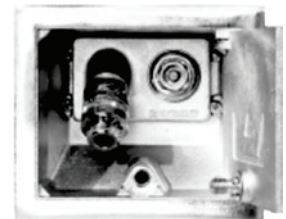
Model 95 Woodford Freezeless Anti-Contamination 34HW Vacuum Breaker (55180 Nozzle Required)