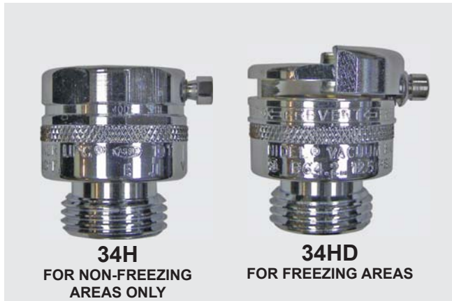
34H FOR NON-FREEZING AREAS ONLY