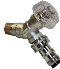
26CP Combination 1/2" Copper Tube 1/2" MPT