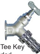
Optional Tee Key Included