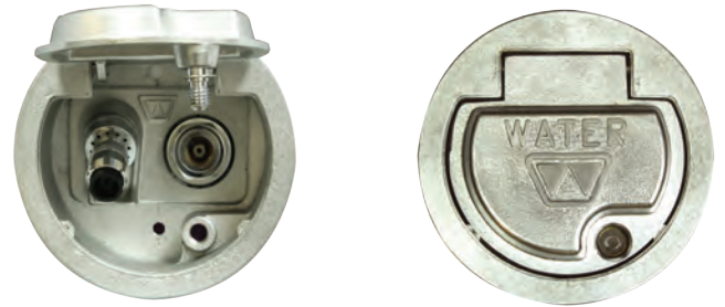
Exterior Finish: Box & Door - Chrome (CH) Only

Wall hydrant shall be a round box type Woodford Model RB67, automatic draining with ASSE 1052 approved NIDEL® Model 50HA high flow double check backflow preventer. 3/4" inlet and outlet (specify type of inlet). Hardened stainless steel operating stem and one-piece valve plunger to control both flow and drain functions. Exterior finish to be Chrome Plated. Loose tee key to be furnished with each hydrant. Intended for irrigation purposes. Wall thickness to be _____ inches.