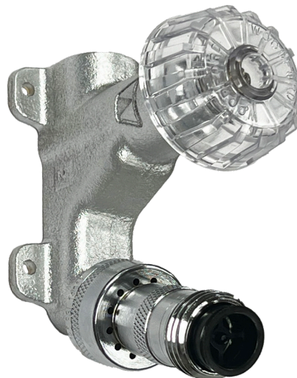
Chrome (CH) Inlet Description Top Inlet 1/2" FPT

EXTERIOR FINISH: Rough Brass (BR) or Chrome (CH)