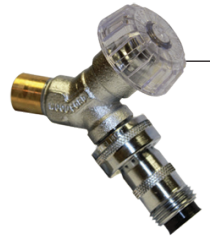
26C Combination 1/2" Copper Tube 3/4" Copper Tube