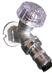
26P-1/2 1/2" FPT