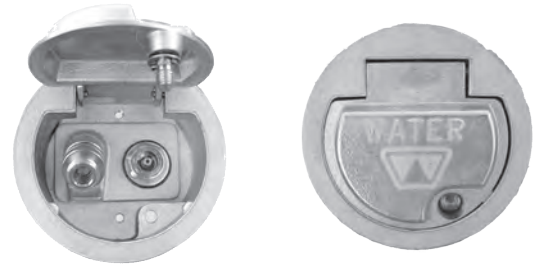
Exterior Finish: Box & Door - Chrome (CH) Only

Wall hydrant shall be a round box type Woodford Model RB65, automatic draining with single check vacuum breaker. ASSE Standard 1019-B approved. 3/4" inlet and outlet (specify type of inlet). Hardened stainless steel operating stem and one-piece valve plunger to control both flow and drain functions. Exterior finish to be Chrome Plated. Loose tee key to be furnished with each hydrant. Wall thickness to be _____ inches.